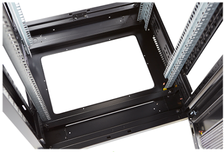
Large base entry