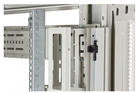
High-density vertical cable management