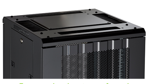
Four-way brush entry roof panel