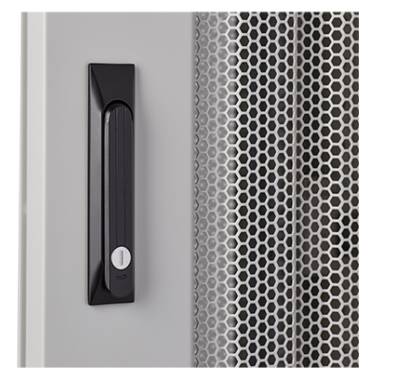
Swing handle wave vented front door